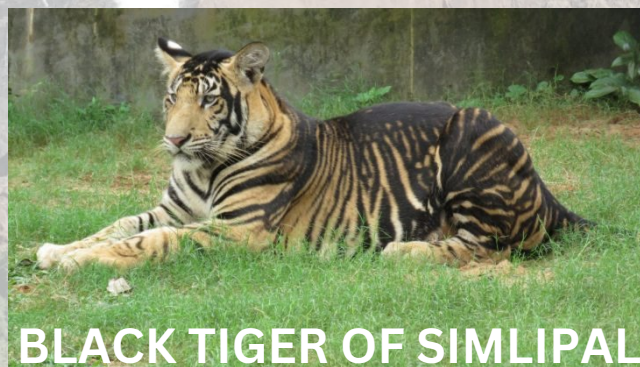
BLACK TIGER OF SIMLIPAL