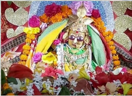
MAA AMBIKA TEMPLE